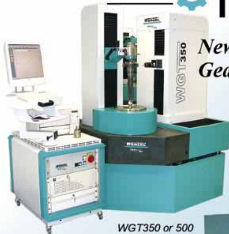
WGT350 or 500

Fast and intelligent gear measurement Full range of machine sizes to 2,000mm diameter Air bearings on all linear and rotary axes Solid granite construction provides optimum stability User-friendly Windows-based software More than just gear measurement